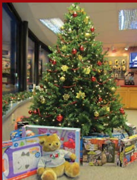
2013 Giving Tree at our Otter Tail Telcom office in Fergus Falls.

This past Christmas, parents of families in need selected Christmas gifts for their children at the Fergus Falls Salvation Army Toy Shop. This Toy Shop would not be possible without the support of our community. In the Christmas spirit, employees and directors of Park Region Telephone and Otter Tail Telcom donated over 100 new toys to aid in the collection efforts. The toys were delivered just in time to be used at the Toy Shop held on December 19th. We are proud to have played an active role in hopefully making another's Christmas one to remember.