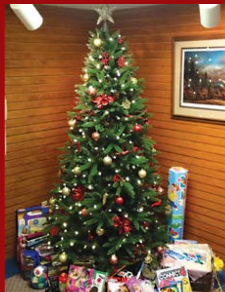
2013 Giving Tree at our Park Region Telephone office in Underwood.